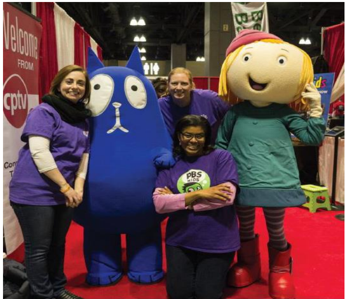
CPTV and Education staff members join PBS Kids characters Peg + Cat at the 2016 Kids Fair

As a statewide provider of ideas and information pertinent to the constituents it serves, CPTV is steadfast in its mission to provide a powerful voice for Connecticut’s diverse communities through the creation of multimedia programs, initiatives, and outreach programs that foster collaboration, inspire understanding, educate, and effect change.